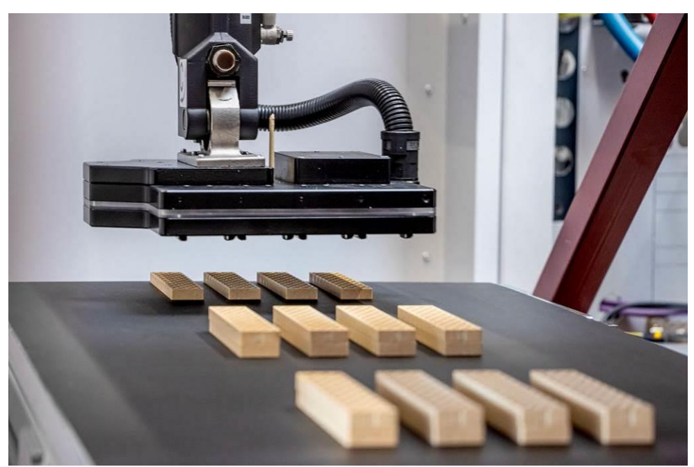
Fig. 3: Demonstration of the HiQ Melt Premium software by the production of bio building blocks from Fasal