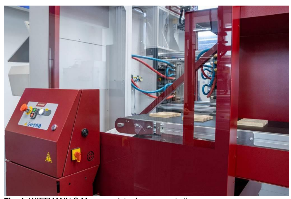
Fig. 4: WITTMANN S-Max granulator for sprue grinding